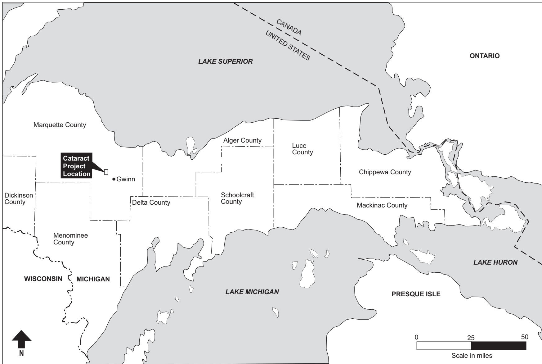
Figure 1. Location map of the Cataract Project.