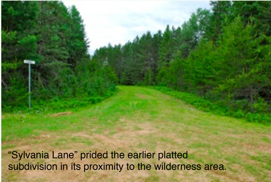
"Sylvania Lane" prided the earlier platted subdivision in its proximity to the wilderness area.